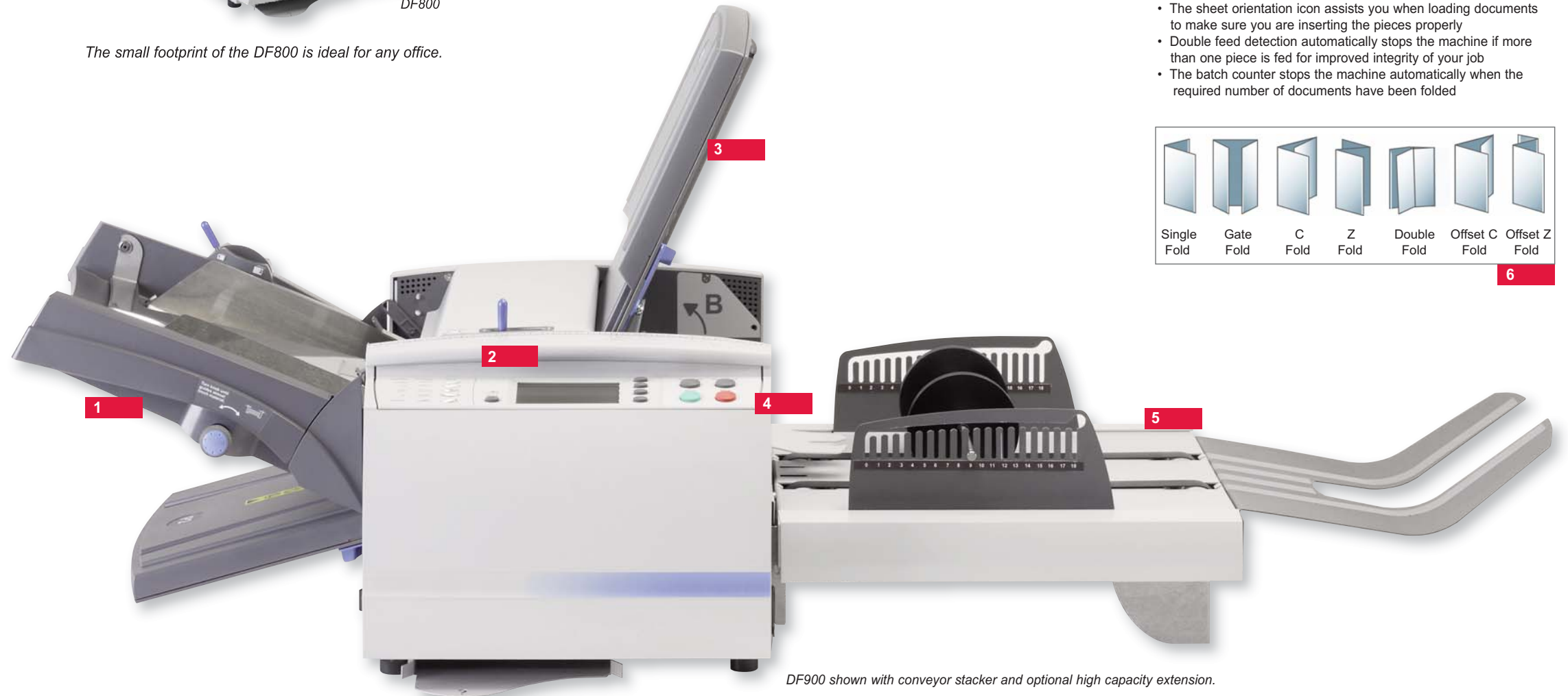
DF900 shown with conveyor stacker and optional high capacity extension.