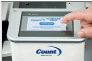
Touch Screen Controller

The COUNT™ iCrease Pro is a simple yet robust solution for creasing of digital media to eliminate cracking when folding. The iCrease Pro gives you all of the automation of bigger COUNT machines in a simple hand-feed machine anyone can use.