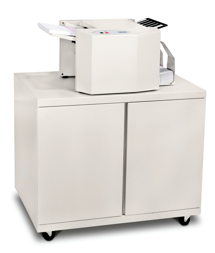
Shown with optional cabinet

The FD 1400 AutoSeal® offers a user-friendly low-volume solution for processing one-piece pressure sensitive mailers. The clearly marked fold plates, control panel, and drop-in feed system provide easy set-up and operation, right out of the box. These features, combined with a sleek desktop design, make the FD 1400 ideal for processing documents in an office environment with low volume applications. With a speed of up to 60 forms per minute and the added capability of processing 14" forms, the FD 1400 enables operators to complete daily processing jobs with ease.