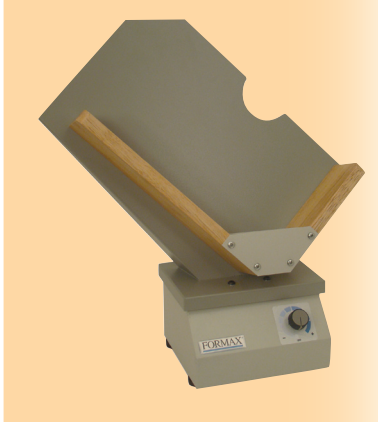
A 402 Series Jogger is a recommended option that reduces static electricity from forms and aligns them for proper feeding