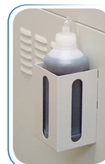
AutoOiler - Automatically pumps oil onto the cutting blades