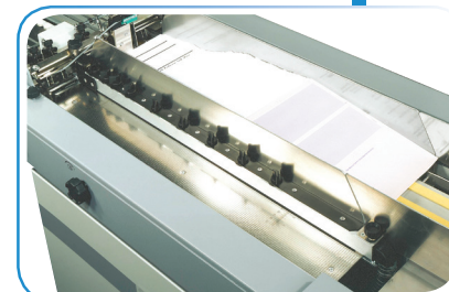
FD 2200 EX