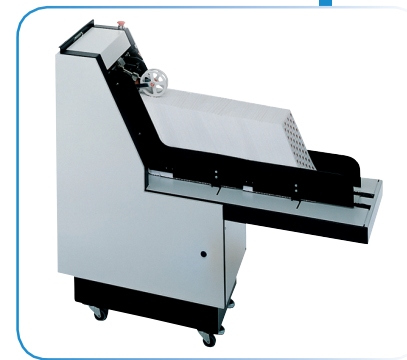
FD 2000-60 Bulk Input Loader (optional)