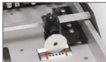
Bottom Air/Suction Feed with Register Guide

Our top-of-the-line air-feed creasing and perforating solution – fast, consistent and accurate.