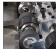
Rotary Perforating Standard