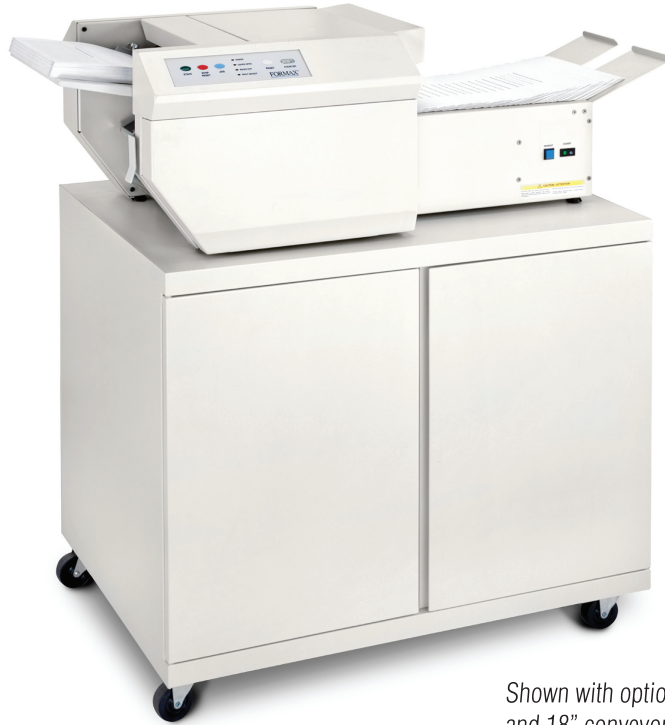
Shown with optional cabinet and 18" conveyor

The FD 2000 AutoSeal ® pressure sealer is a powerful desktop model designed to process pressure sensitive self-mailers. An easy to use touch-pad control panel and three-roller drop-in feed system make this product both practical and dependable. Standard features include a six-digit counter, jog control, fault detection, and LED indicators. Up to 200 forms can be loaded in the hopper and processed at speeds up to 7,000 forms per hour. The FD 2000 also has an optional fully enclosed cabinet for storage and an 18" or 4' conveyor with photo-eye for neat and sequential stacking of processed forms.